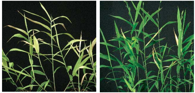
Figure 3. Leaf chlorosis observed in Chasmanthium latifolium was corrected by application of iron chelate at the manufacturer's recommended rate. Non-treated control plants (left) and plants that received a media drench of iron chelate (right) were photographed four weeks after the chelate application was made.

When left unattended, foliar chlorosis can progress to leaf necrosis and diminish the plant quality. Foliar tissue analysis indicated that this foliar chlorosis is due to iron deficiency. Application of chelated iron such as a foliar spray of diamine triamine penta acetate (DTPA) or a media drench of ethylene diamine dihydroxy methylphenyl acetate (EDDHA) can correct these deficiency symptoms when applied at the manufacturer's recommended rates (Figure 3). EDDHA is a red-colored compound and if splashed on the foliage, an unsightly red residue is left behind. Hence, the foliage should be rinsed off