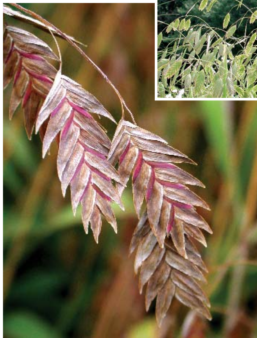
Figure 1A and B. Chasmanthium latifolium plants provide movement and texture to a summer garden, while inflorescences add color and interest to a fall and winter garden.

Container production of chasmanthium is as easy as growing and maintaining it in the garden. Consumers prefer buying plants in flower, and ornamental grasses follow suit. While some grasses may be difficult to produce and market in flower,